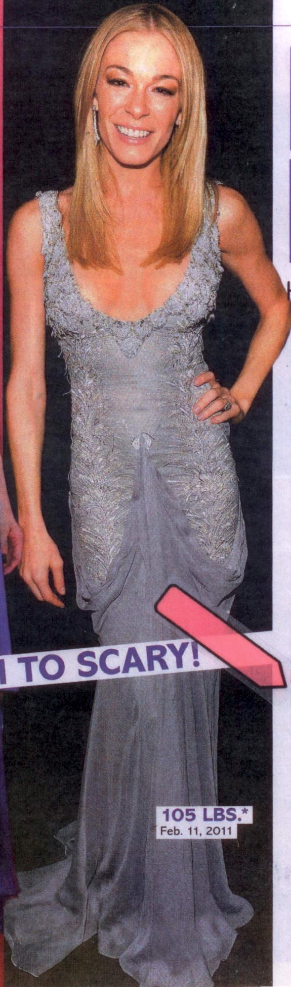
105 LBS.* Feb. 11, 2011