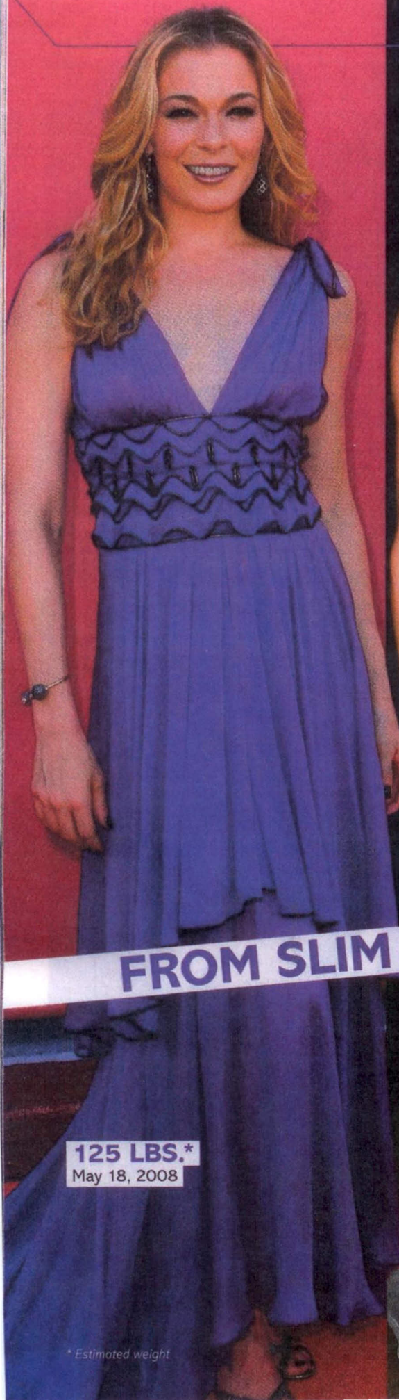
125 LBS.* May 18, 2008